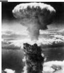
The United States drops an atomic bomb on Nagasaki, Japan three days after dropping one on Hiroshima. Japan surrendered five day later, ending World War II.